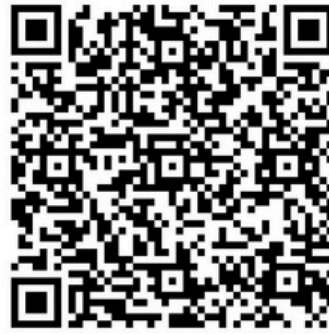
Google Form Link

Our Children's Ministry is growing, and we are looking for caring hearts willing to serve the next generation. Whether you can help regularly, serve as a substitute when needed, or assist during special events, there is a place for you. Please scan the QR code to learn more and prayerfully consider joining our Children's Ministry Team.